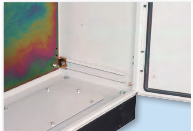
* Bottom internal view