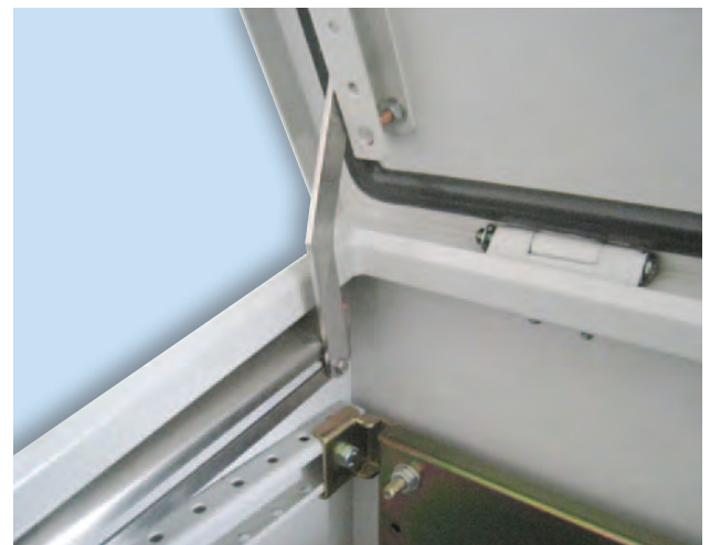
* Top internal view